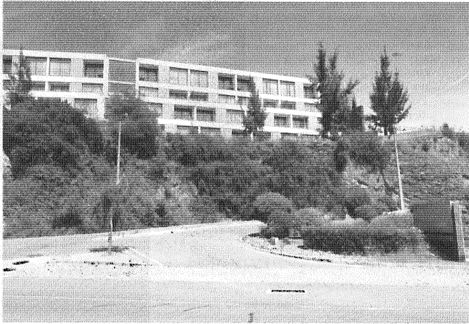
The resort is located in Caldas

Pedro Seabra from Discovery said in a press release this week that the opening